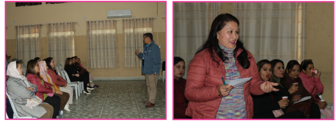
A valuable Parenting Session was conducted for the Middle School parents, facilitated by our experienced school counselor. The session focused on helping parents develop and encourage positive habits and behaviors in their children, which are crucial for both personal growth and academic success. Parents were guided on practical strategies for instilling healthy routines, improving time management, and promoting self-discipline in children. The session offered parents a chance to ask questions and share experiences, creating a collaborative atmosphere.