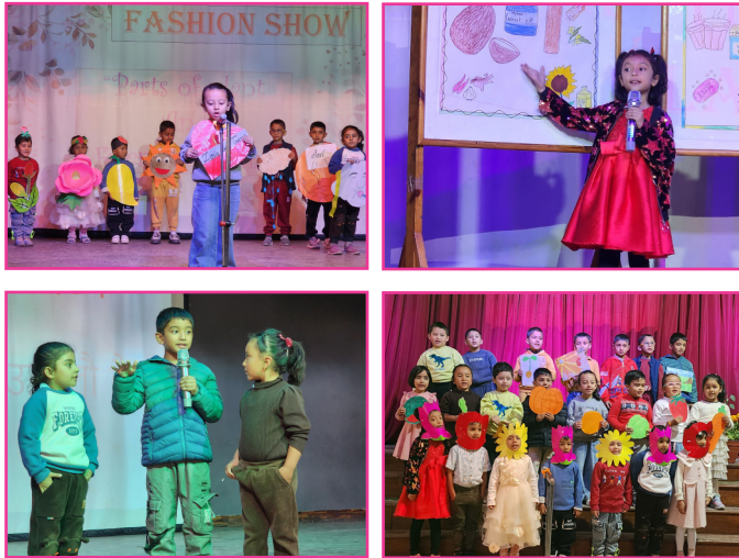
The little young kindergartners conducted their Second Project Day, and showcased the learning outcomes based on the theme 'Plants'.