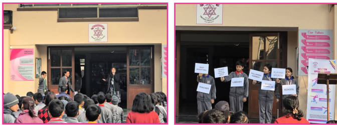
In an inspiring initiative, Middle School students recently conducted a series of Social and Emotional Learning (SEL)-led assembly activities to raise awareness across the school about crucial SEL aspects. The students took the lead in educating the entire school community on important topics such as managing adolescence and creating safe spaces. Through engaging role-playing, and interactive activities, they highlighted the importance of understanding emotions, building healthy relationships, and dealing with challenges faced during adolescence.