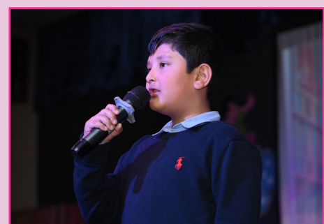
Grade II celebrated their Class Day on a theme 'My Ideal School'. The young learners showcased their performing arts like dances, dramas, songs, gymnastics and wushu to their parents. Their poems and presentations woven on the theme depicted the picture of their ideal school.