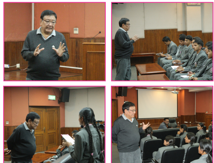
कक्षा १० का विद्यार्थीहरूले विश्वप्रसिद्ध आँखा विशेषज्ञ डा. सन्दुक रुइतसँग उहाँकै कार्यस्थल तिलगंगा आँखा प्रतिष्ठानमा अन्तरक्रिया गर्ने विशेष अवसर प्राप्त गरे । उक्त अन्तरक्रियाले विद्यार्थीहरूलाई डा. रुइतको बाल्यकाल, डाक्टर बन्ने प्रेरणा तथा सङ्घर्षबाट धेरै कुरा सिक्ने मौका प्रदान गर्‍यो । डा. रुइतले विद्यार्थीहरूलाई विशिष्ट उद्देश्य लिएर अधि बढ्न र नेपालको सुखद भविष्यको लागि कर्मशील हुन हौसला दिनुभयो ।