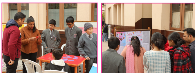
In a remarkable display of leadership, Grade 7 students took the initiative to engage and inform the parent community about the importance of Social and Emotional Learning (SEL). The students organized an informative session aimed at raising awareness of the various SEL components, such as emotional regulation, building empathy, and creating safe spaces. They also advocated for the integration of SEL strategies at home, emphasizing how parents can support their children's emotional development in everyday life.